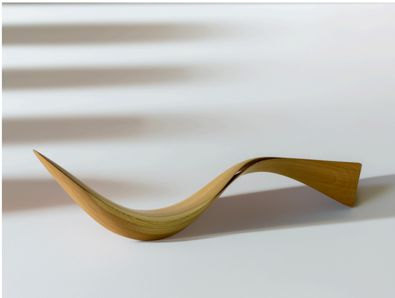
"Mokugei" by Kenta Hirai Medium: Yoshino Cedar Dimension: 80 x 12 x 20 cm, Year: 2025

Mokugei is a sculptural whale formed from delicately layered cedar, allowing the natural grain of the wood to emerge as an integral element of its expression. The flowing contours evoke the graceful movement of a whale gliding through water, while the rhythmic grain patterns accentuate a sense of motion and vitality.