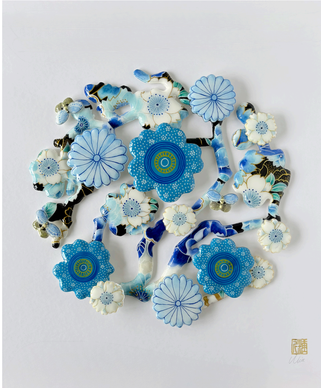
"Flowering Branches in Blue"