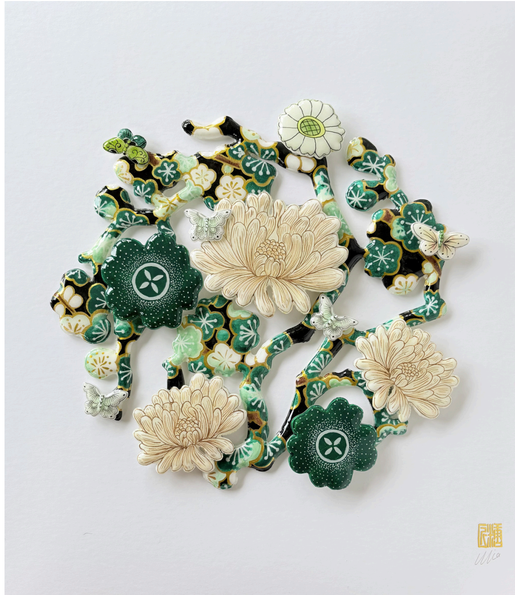
"Flowering Branches in Green"

Essentially, she has developed a way to 'fossilize' sugar, transforming it from a delicate substance into a durable, glass-like mineral. By fusing the sugar's natural crystal structure with high-end binders, she creates a material that is waterproof, scratch-resistant, and built to last.