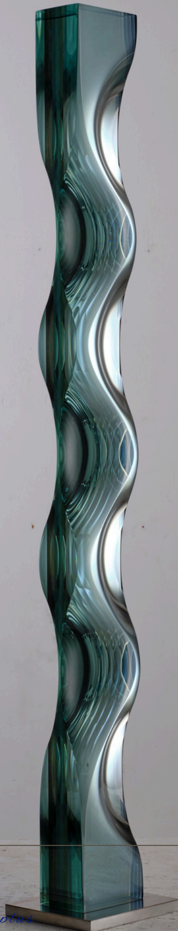
"Move M.251201" by Toshio Iezumi

Medium: Heat Reflective Glass, Half Mirror, Handmade, Carved and Polished Dimension & Year: 100 x 10 x 7 cm, 2025