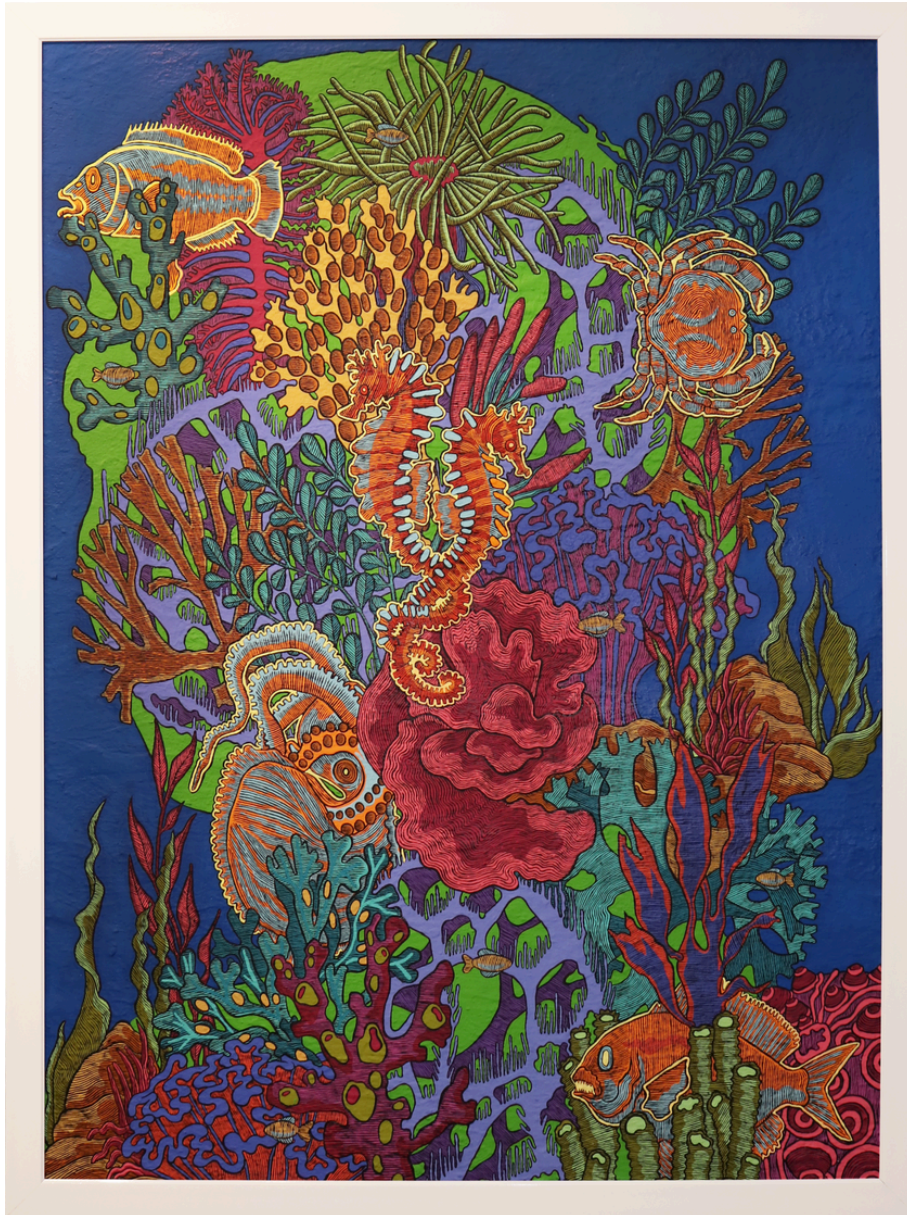
"Diving to the Same Depth as You" by Jane Cuevas Medium: Acrylic on Canvas, Dimension & Year: 91.44 x 121.92 cm, 2024

This piece is a visual archive. A curated chaos of symbols, memories, and contradictions. At the center, a cat rests atop an old computer monitor, its eyes wide with wonder or suspicion. A quiet observer of the digital clutter below. The screen displays a distorted human face, abstracted and broken, accompanied by a disembodied ear. It represents our fragmented identity in the digital age, constantly shaped and reshaped by the screens we live behind.