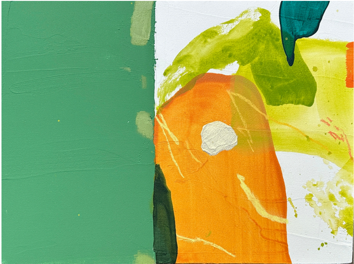
"Driving Around In Subic IV" by Gabby Prado Medium: Acrylic on Canvas, Dimension & Year: 12 x 16 in, 2026