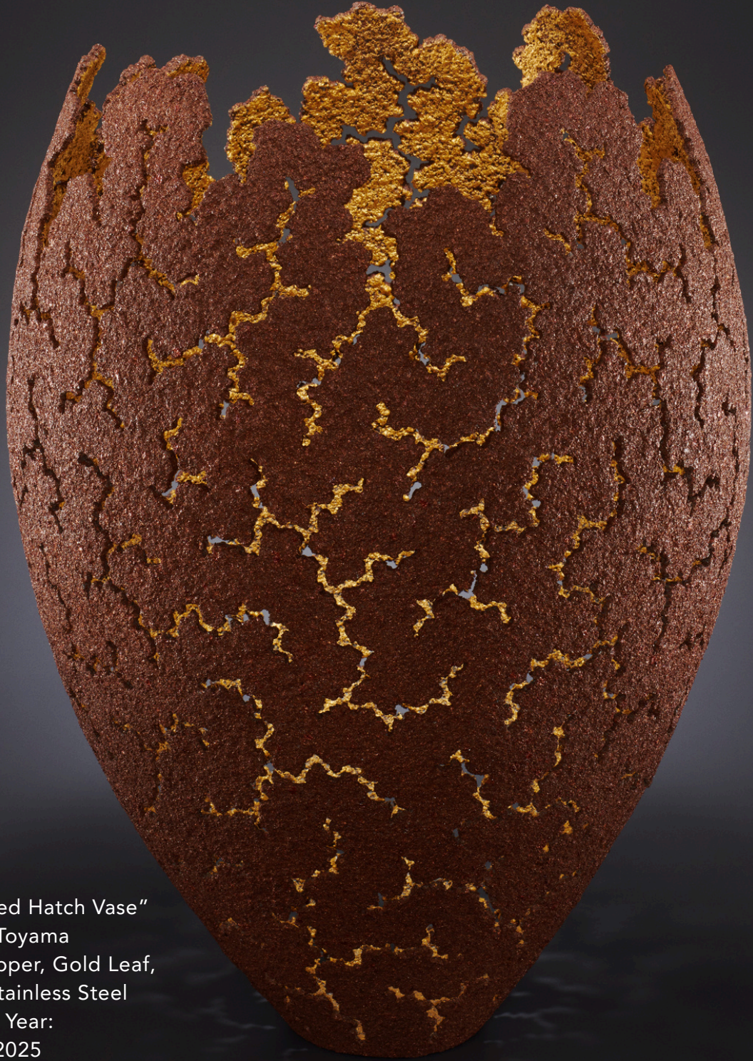
"Biophilia; Red Hatch Vase" by Kazuhiro Toyama Medium: Copper, Gold Leaf, Aluminum, Stainless Steel Dimension & Year: 47 x 34 cm, 2025